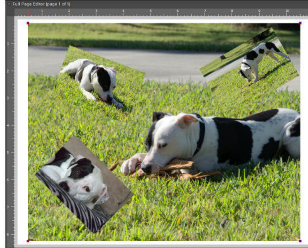
Qimage Ultimate v2015.106

Simply open your image(s) in the editor, apply the desired rotation, and when you add the rotated image to the page/queue, the white bounding triangles in the corners will be transparent!